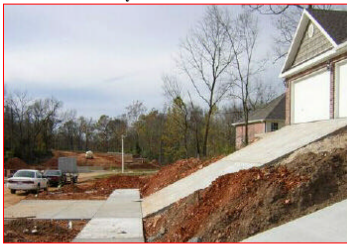
What a view?