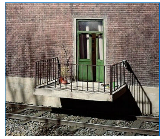
Stairway to Heaven??