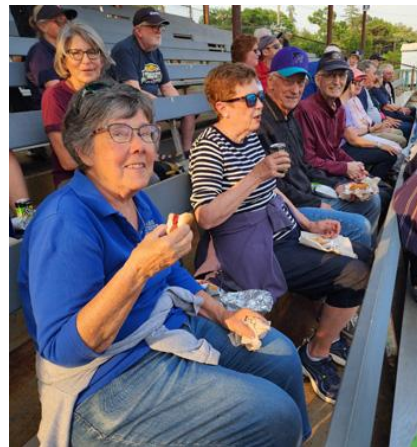
And a good time was had by all !