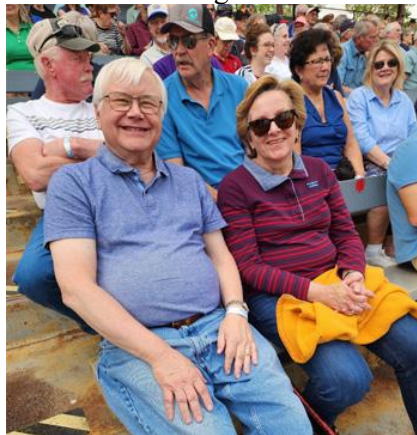
Food and drink were available ...