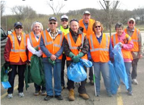
It was flat but lots of garbage in the ditches and butts!!! Lots of smokers drive that road! Rest up for next year!

Just wanted to say THANKS again! We did a great job and they have picked up the bags already...we had 3 full bags... 2 of garbage and 1 of recycles.