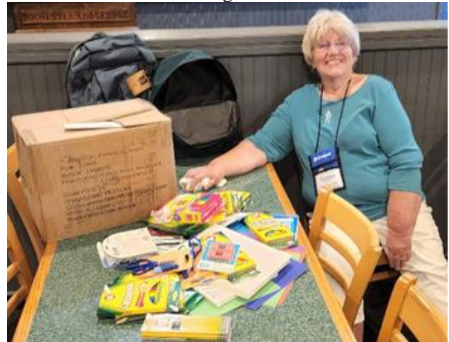
And more supplies ....

Elementary school supplies gathered up for distribution to the incoming classes.