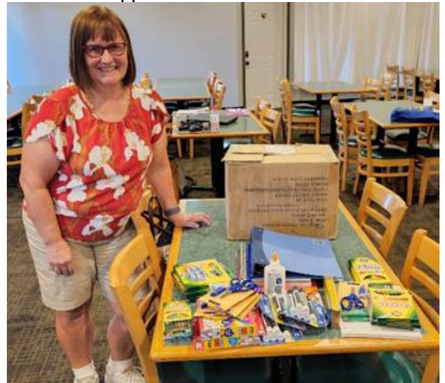
And even more supplies ...