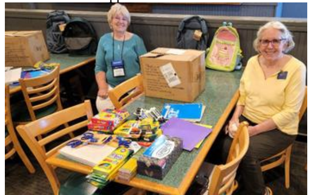
There was even more, so the sorting down into individual schools for delivery took a little longer.