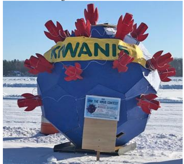
Rice Lake Wisconsin Kiwanis Club

Buy a ticket and pick the date for the frozen lake ice to breaks up and the “Virus Sinks.” This is definitely “out of the box” thinking.