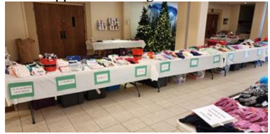
Upper Level – stay warm