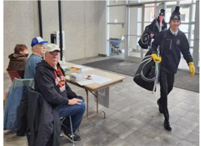
Dress warmly when watching the games ...