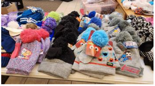
Lower Level – more fun stuff