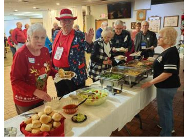
Special desert goodies provided by membership ...