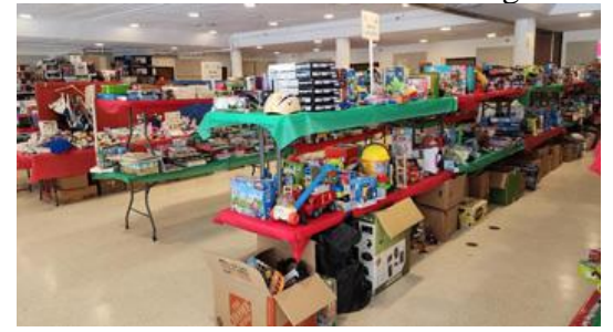
Upper Level – ages and sizes