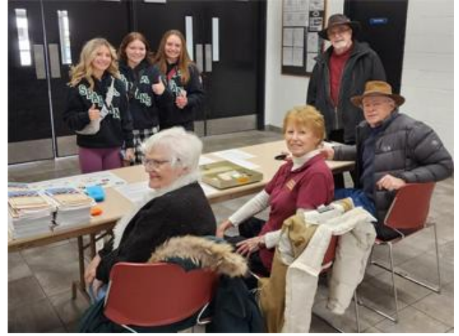
Even backdoor ticket sales were brisk ...