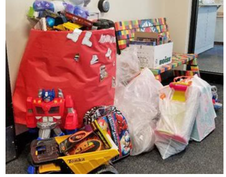
Lower Level – overwhelming