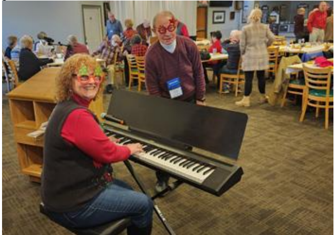
Continued next column \rightarrow