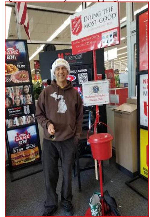
We had to call-in to have our kettle emptied! Hope you have a great day.

Maureen and I had a lot money come in. Even a $100 bill! We ad a very active Weds 1-3pm as people were preparing for a snow day and shopping!!